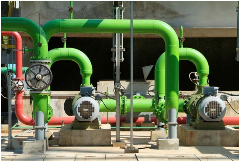
Industrial DC Motors